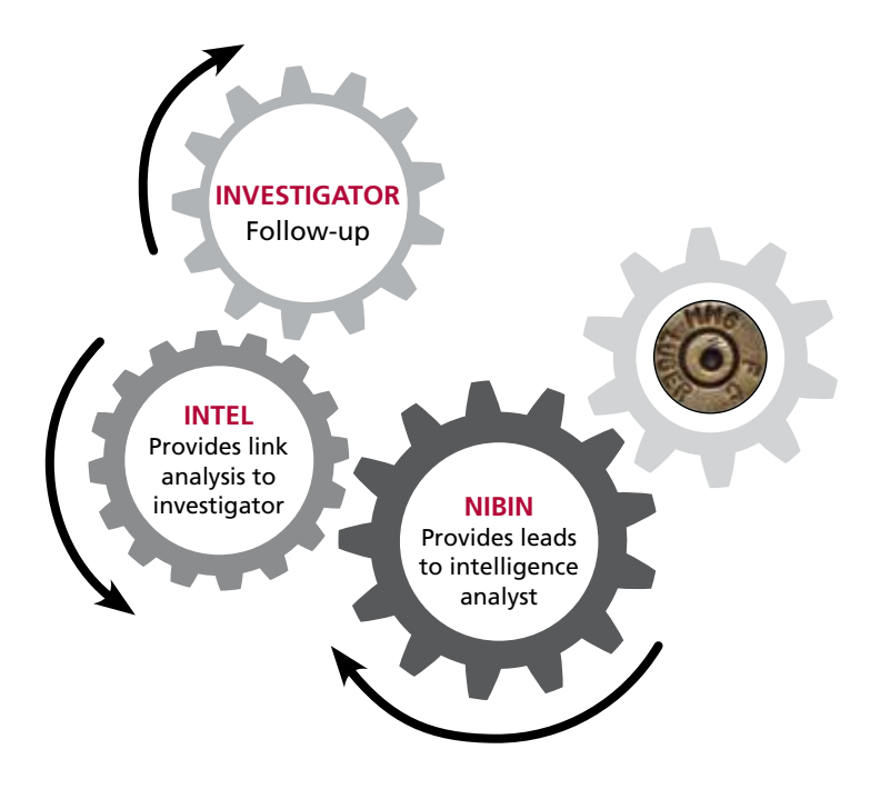
Figure 7: Interactive and constant processing

As important as it is, IBIS is but one piece of the technology puzzle. There are many others that have value in not only establishing potential links between shooting incidents but in providing intelligence to identify suspects. It is important to leverage all this information and the best way to do that is through comprehensive, timely, and reliable link analysis. As important as the link analysis is in bringing this all together, it will not mean much if the proper avenues of communication have not been established for the rapid and proper dissemination of the intelligence to investigators. The goal is to develop pertinent information from all available sources into actionable leads, as well as provide investigators and prosecutors with irrefutable data to corroborate witness testimony.