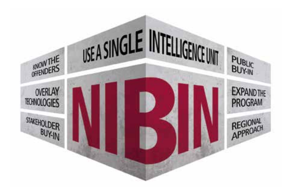
Figure 3: Components of a preventive crime gun strategy

There are eight components that make up an effective and sustainable preventive crime gun strategy. Each component is addressed in its own chapter which includes an overview followed by a discussion of the critical elements.